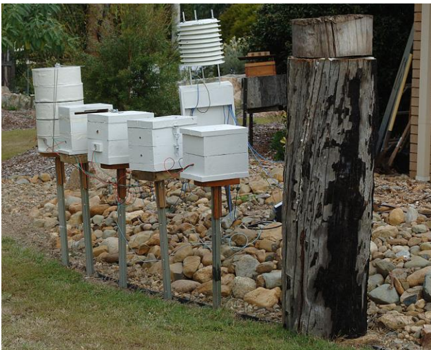
The T hockingsi log, and a series of hive box types under test using a datalogging temperature recorder, taking a reading every 10 minutes . The log has a block on top as well as a sealing piece of plywood, to reduce effect of the sun from the top. The 'Stevensons Enclosure' is the ventilated structure at the rear where ambient is recorded. All are in full sun.

effect that the log has had in this test. The response has been repeated in multiple recording sessions, and is very consistent. Statistical analysis has show the differences to be significant. I intend to set up a permanent recording system to give more data on this, and other hive environments. Certainly the lag in temperature response in the hollow is surprising and dramatic, the peaks and troughs of the ambient temperature are removed. The green line from a sensor inside a Trigona hockingsi colony in the log, believed to be in the involucrum protected brood area because of bee response to the placement of the sensor, causes a slight further lag in temperature but simply lifts the hollow temperature some 7-8 °C . This is a small piece of data, much more is needed to explain conditions that exist within colonies. I intend to add more to this discussion, including some similar graphs of the responses of artificial box structures. Temperature in these have a very short lag in general, of the order of 2-3 hours at best, a very different set of conditions to a hollow log